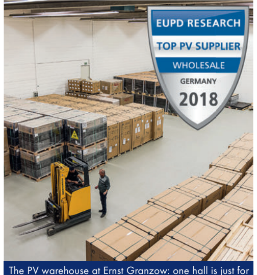
The PV warehouse at Ernst Granzow: one hall is just for modules.

That is not something you will often hear in