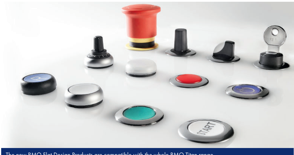
The new RMQ Flat Design Products are compatible with the whole RMQ Titan range

Eaton launches a new range of command and signalling devices, the RMQ Flat Front and RMQ Flat Rear components.