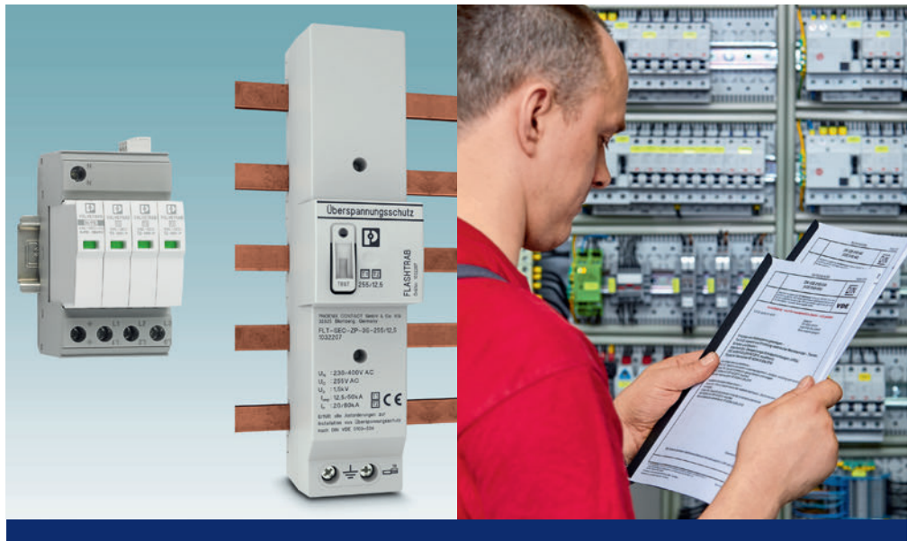
Surge protection for mounting rails and busbars. Type 2 and type 1/2 lightning arresters fulfil all the requirements.

Ideally none! If the fuse protection of the installation is not greater than the maximum permissible back-up fuse of the lightning arrester, you don't need any additional back-up fuse. That usually goes up to 315A – check the spec sheet. For all other cases there is a lightning arrester with built-in back-up fuse. That saves space and valuable cable length. And what's more, the built-in back-up fuse is generally monitored via the status display.